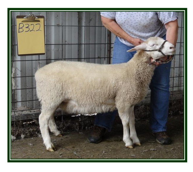
LOT 12: FALL EWE LAMB