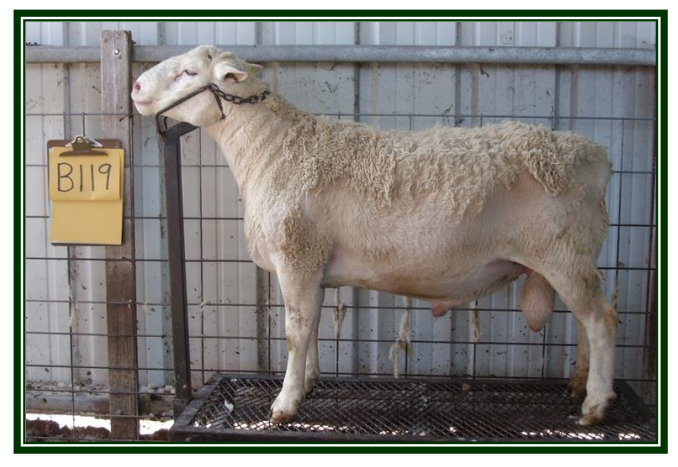
LOT 1: YEARLING RAM

Glenn Land Farm White Dorpers have found a niche in both the upscale restaurant and farmer's market trade as well as in the ethnic community. Pasture finished lamb is desired by a large portion of the specialty market consumers and White Dorpers fit the specs perfectly. You may already be selling to these markets, but if you are not you should strongly consider the virtues of this breed of sheep in the market scheme of the major population centers of the western states. At Glenn Land Farm we are very excited about these sheep and we know you will be too once you try them. All of the consignors at the production sale are equally excited about Dorpers and hope you can come and enjoy a special day devoted to this breed.