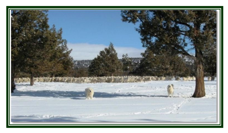
LEWIS WHITE DORPERS