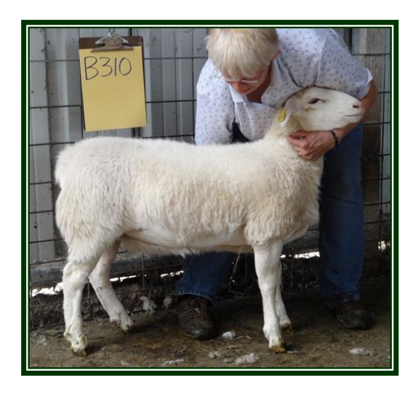
LOT 16: FALL EWE LAMB