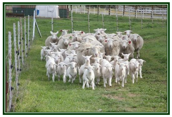
GLENN LAND FARM