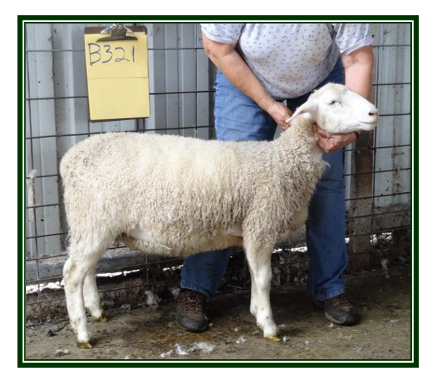
LOT 15: FALL EWE LAMB