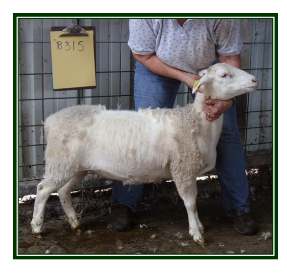
LOT 11: FALL EWE LAMB

B315 EP078619 DOB: 11/17/12 Codon: Birth/Rearing: Twin