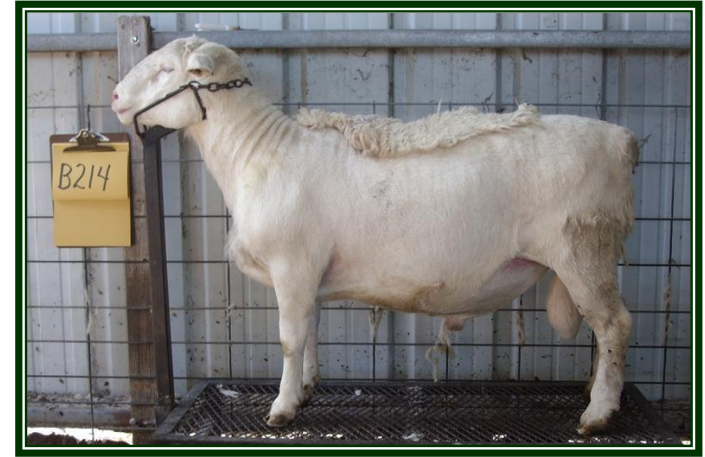
LOT 2: YEARLING RAM

This outstanding ram is sired by an Australian ram and out of a very productive ewe line. He is very balanced as well as being extremely muscular.