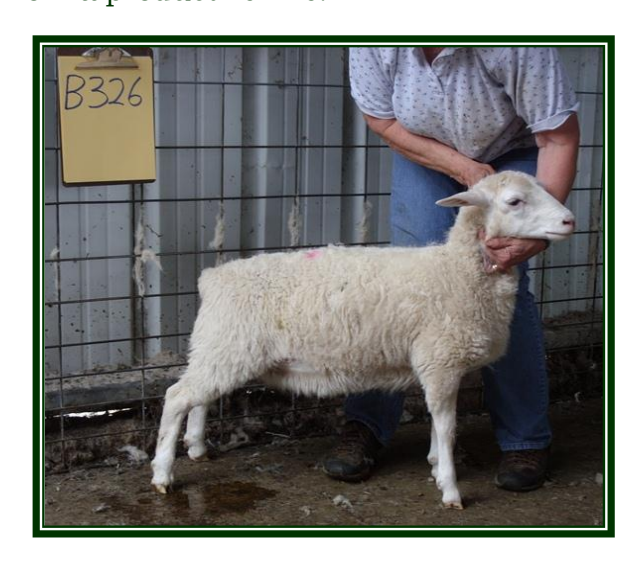
LOT 14: FALL EWE LAMB

This fall ewe lamb is a deep bodied, broody ewe from a productive line.