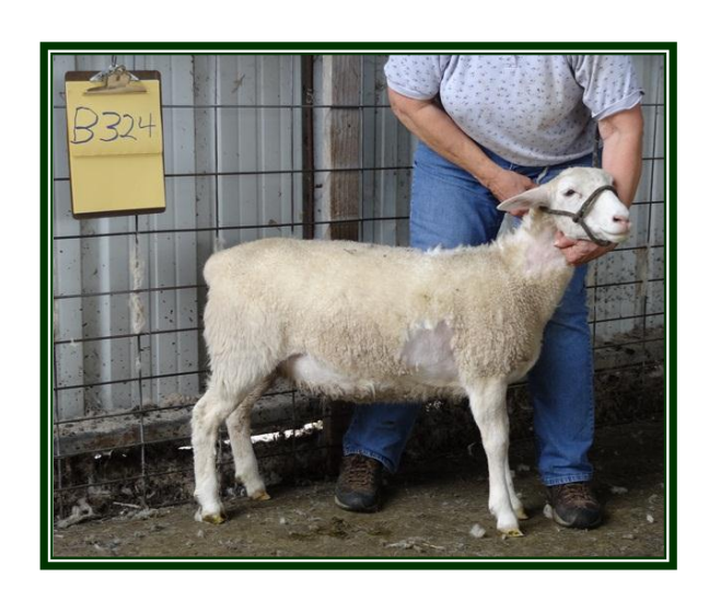
LOT 13: FALL EWE LAMB

Very growthy, going to be a big, productive ewe. She is a complete shedder.