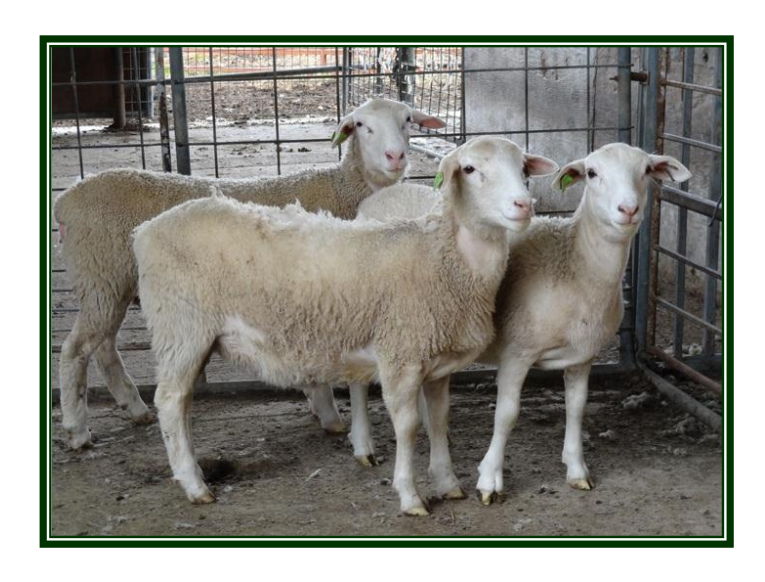
LOT 17: PEN OF 3 FALL EWE LAMBS (Commercial)

A very growth ewe lamb with a lot of body thickness and perfect eye pigment. She will be a complete shedder.